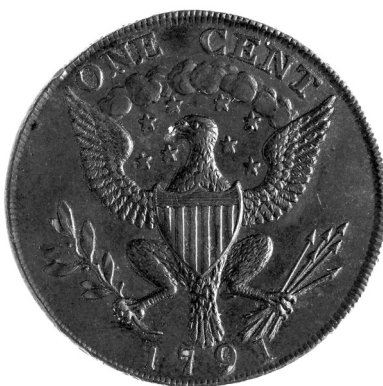
2. Washington pattern cent, 1791.