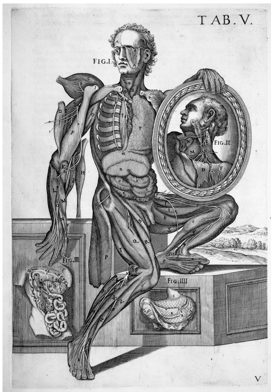
Écorché from Pietro da Cortona's Tabulae anatomicae ... (Rome, 1741). Marquand Library of Art and Archaeology, Princeton University.