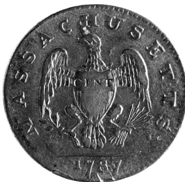
1. Massachusetts, copper cent, 1787.