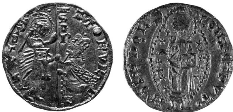
4. Rome, fourteenth century, gold senatorial ducat.

the medieval Roman Senate (which identified itself on the reverse with the classical abbreviation SPQR: Senatus Populusque Romanus) (fig. 4). These coins were clearly modeled on the popular ducat of Venice, with Saint Peter replacing Saint Mark on the obverse and the place of the doge taken by an anonymous senator. The purchase of these coins, which complement the imitation ducats from eastern Mediterranean mints we have acquired in recent years, was made specifically for a project undertaken by a graduate student in the Seminar in Ancient and Medieval Numismatics offered in spring 2011.