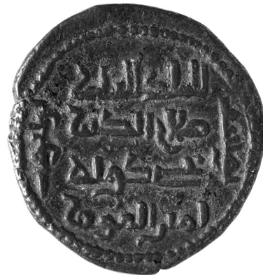
3. Zangids of Mosul, Nasir ad-Din Mahmud, AH 541–569 (1145–1173 CE), copper fals.