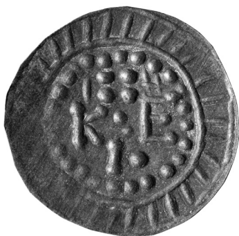
5. Cappadocia, brass token, Kelveri, 1884.

the medieval Roman Senate (which identified itself on the reverse with the classical abbreviation SPQR: Senatus Populusque Romanus) (fig. 4). These coins were clearly modeled on the popular ducat of Venice, with Saint Peter replacing Saint Mark on the obverse and the place of the doge taken by an anonymous senator. The purchase of these coins, which complement the imitation ducats from eastern Mediterranean mints we have acquired in recent years, was made specifically for a project undertaken by a graduate student in the Seminar in Ancient and Medieval Numismatics offered in spring 2011.