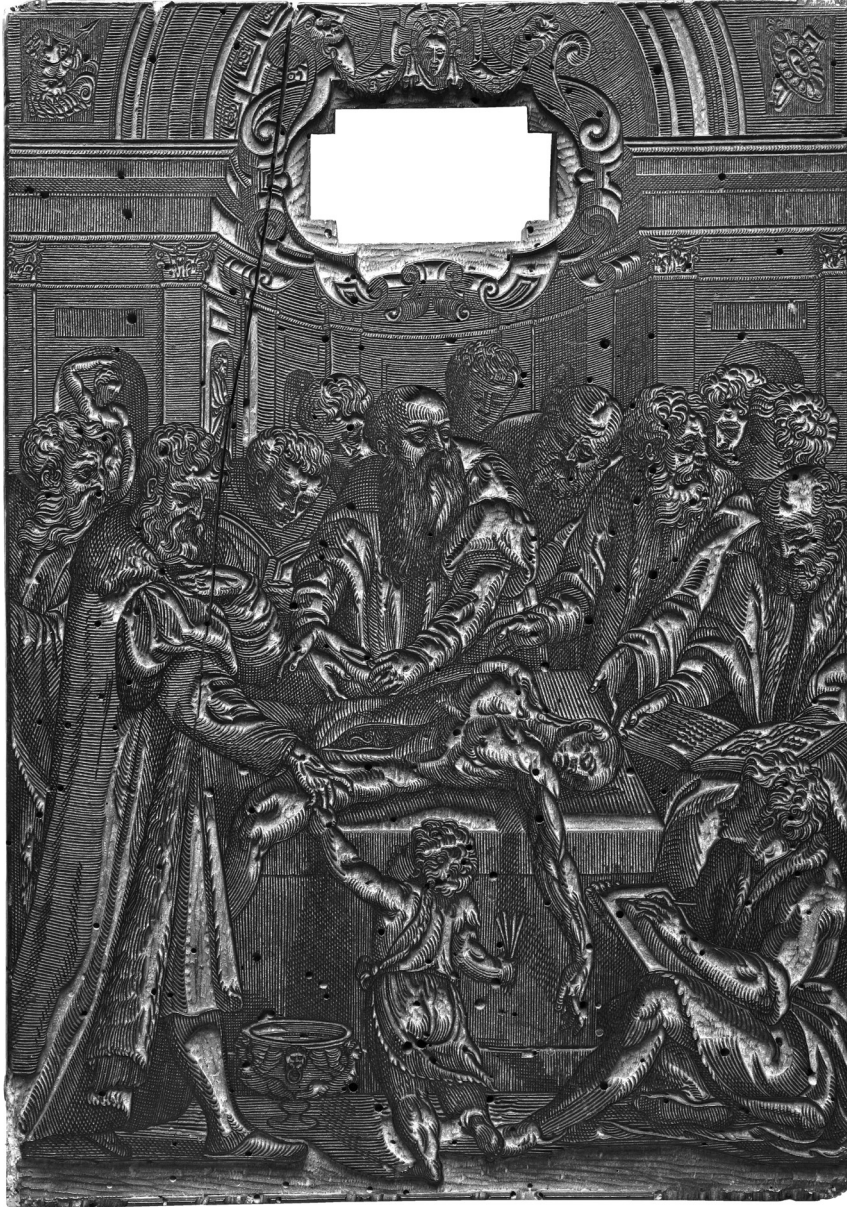
Original woodblock for the frontispiece of Realdo Colombo's De re anatomica libri XV (1559). Graphic Arts Collection, Department of Rare Books and Special Collections, Princeton University Library.